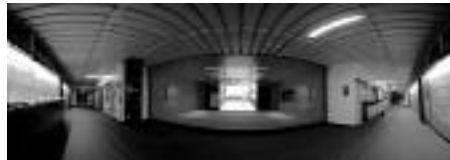
Figure 2. Panoramic picture of the portal powerwall showing the projection screen integrated into the building.

This portal is located in a public space, and is integrated architecturally into the building. The powerwall provides us with feedback from students and faculty, and proves that immersive installations can be deployed to a larger public.