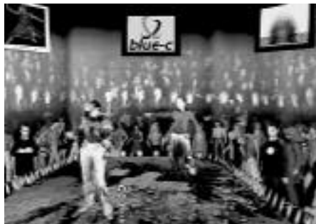
Figure 6. Screenshot: FashionShow. The user experiences herself on a virtual catwalk in real-time.

To demonstrate the functionalities and possibilities of our framework, the application FashionShow has been developed. We designed a virtual architecture (Maher, Simoff, Gu and Lau, 2000) where the users experience the immersion and stereoscopic depth of the system. Digital architectural models are enriched with textures, billboards, images, animations, movies and 3D