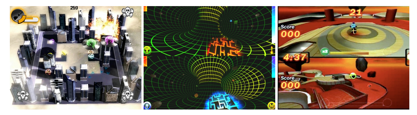
Figure 1: Screen shots of the three game projects discussed as case studies. To the left, the game "Battle Balls" is shown, in the middle "Titor's Equilibrium," and to the right "SPHERES."